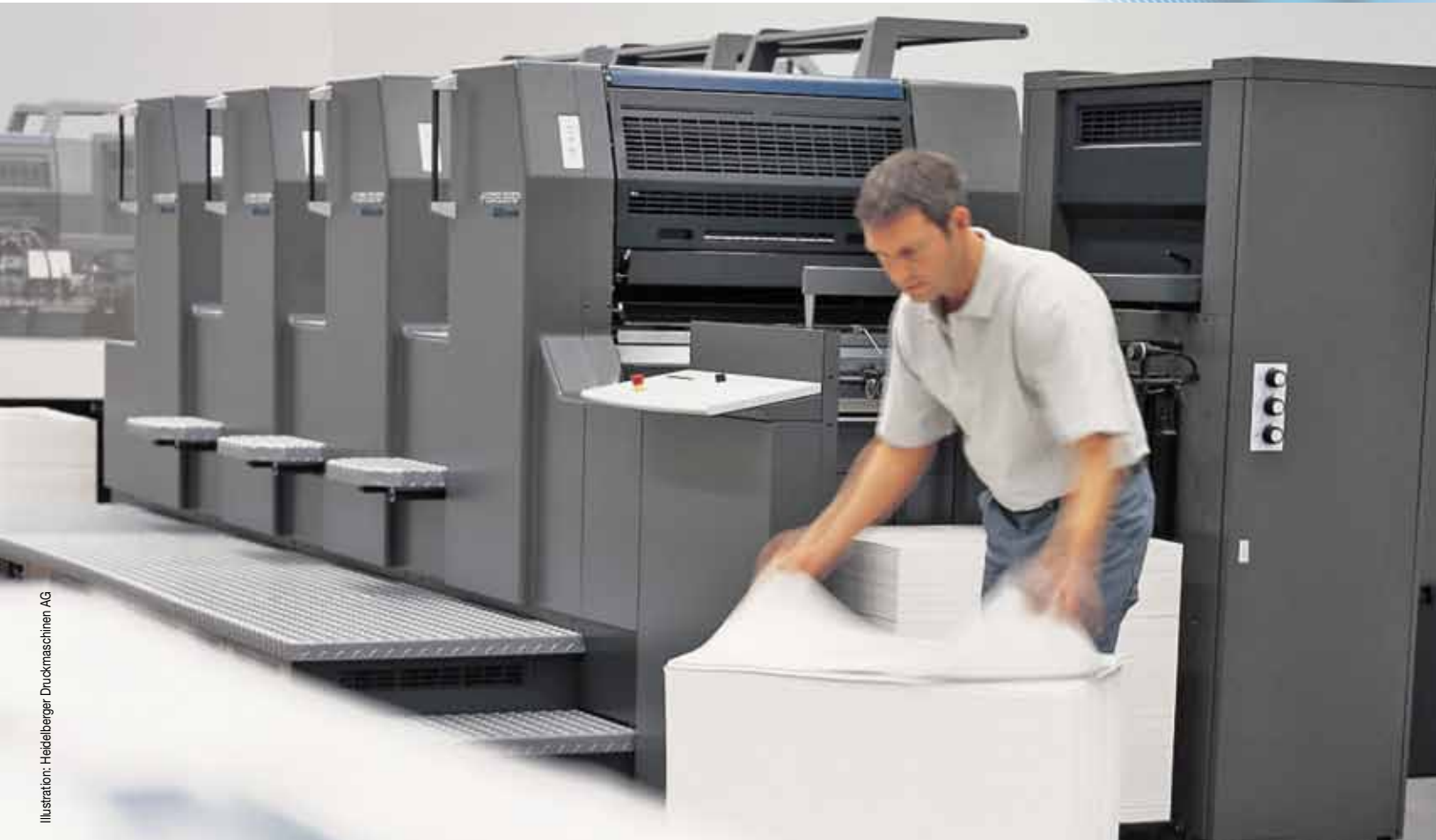
Illustration: Heidelberg Druckmaschinen AG

Convenience you want. Expertise you need.™